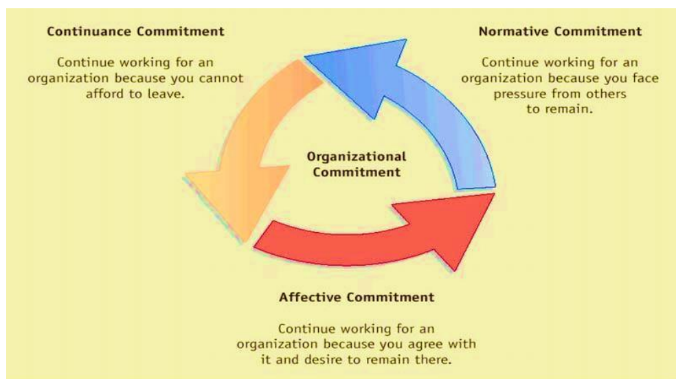
Fig. 2. Organization Commitment Process.

The definition of employee commitment according to Richard T. Mowday et al. (1984) is an organizational commitment to determine the power of the individual from the identification and complicity of individuals in a specific organization. This shows that organizational commitment means involving the loyalty of all employees. Employee commitment i.e., organizational commitment is a work attitude that describes the feelings of one person, whether they like or aversion the organization in which their occupation (Robbins & Judge, 2014). This commitment is categorized as work behavior or effective communication, related to how much the individual feels that his values and goals match those in the organization. The greater the congruence between individual and organizational values and goals, the higher the communication between employees and the organization. The organizational commitment process is outlined in Fig. 2 below: